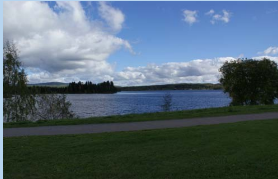
WALKABOUT IN BOLLNÄS

The third transnational meeting in MASS was held in Bollnäs, Sweden at the end of September 2010. 15 guests and the Swedish hosts took part at this meeting.