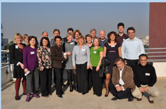
PARTNERS LINED UP FOR THE TRADITIONAL GROUP PICTURE

AFTER A LOT OF PREPARATIONS THE TRANSNATIONAL PROJECT MASS HAS STARTED!