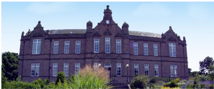
Isla Building, Arbroath

Angus College is one of the most highly respected further education colleges in Scotland. We are active in Leonardo, Grundtvig, Comenius and Transversal projects which provide opportunities for professional development, personal growth and training for staff and students. Visit our web page at www.angus.ac.uk to find out more.