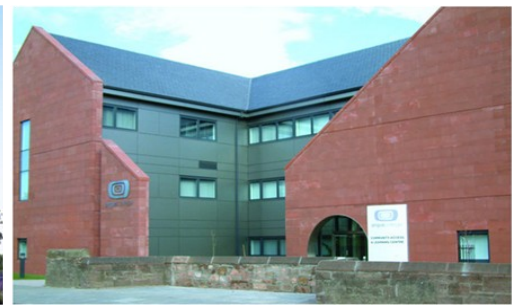
CALC Building, Arbroath